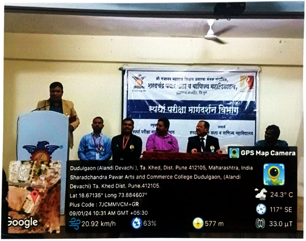
While student attending Session Sincerely On 09 January 2024