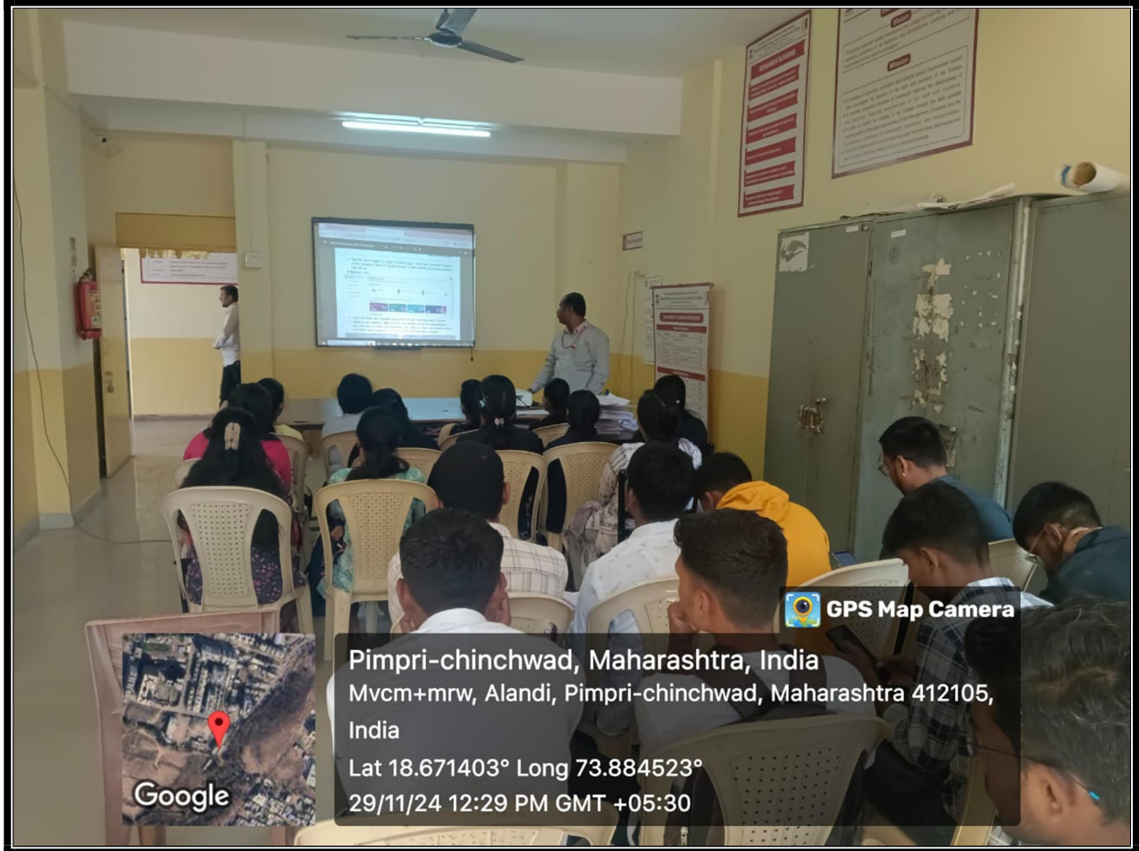
HoD. Of BCA giving ICT lecture