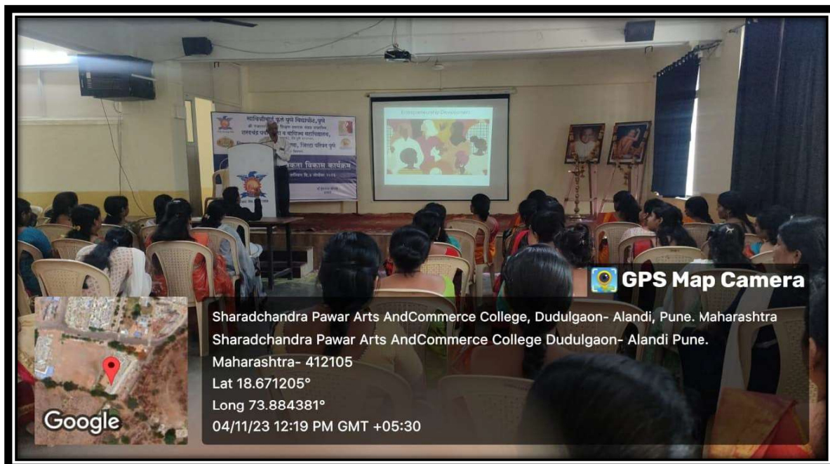
(The Chief Guest guided the women through the PPT.)