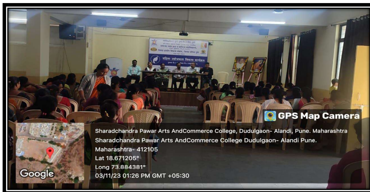
(Women actively participated in workshop)