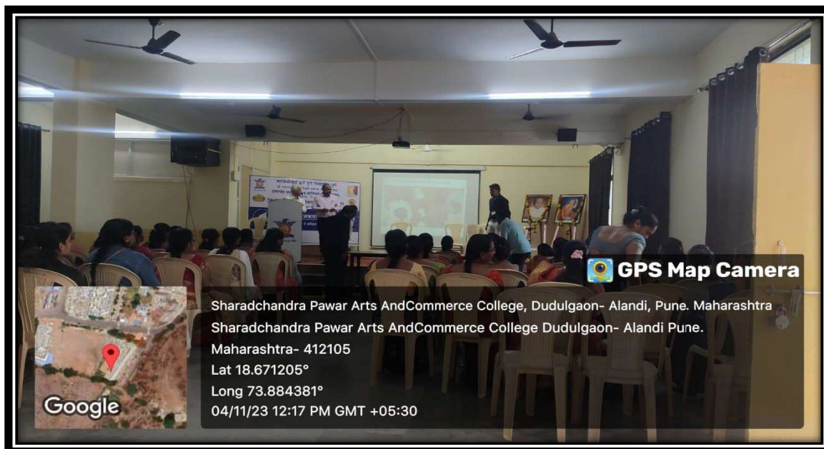
(All women and Students are curiously attending the workshop.)